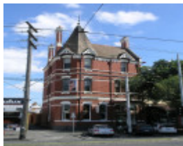
ANZ BANK SOHE 2008