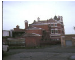
anz bank queens parade fitzroy north rear view 1989