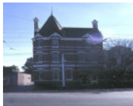
anz bank queens parade fitzroy north front view jul1986