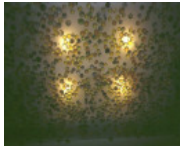
Delbridge House Eaglemont Lights 1995