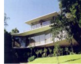
1 delbridge house frontview 1999