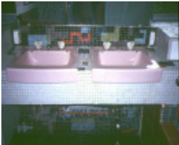
Delbridge House Eaglemont Bathroom 1995