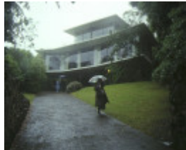
Delbridge House Eaglemont Exterior 1995