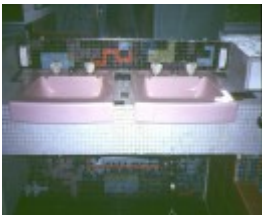
Delbridge House Eaglemont Bathroom 1995