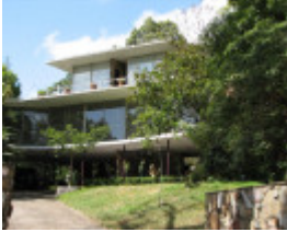
THE DELBRIDGE HOUSE SOHE 2008