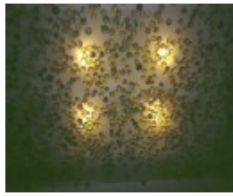
Delbridge House Eaglemont Lights 1995