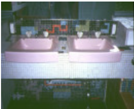
Delbridge House Eaglemont Bathroom 1995