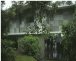
Delbridge House Eaglemont Rear View 1995