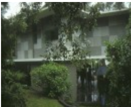
Delbridge House Eaglemont Rear View 1995