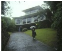
Delbridge House Eaglemont Exterior 1995