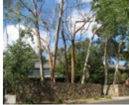
THE DELBRIDGE HOUSE SOHE 2008