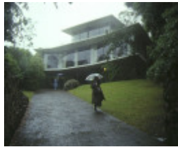
Delbridge House Eaglemont Exterior 1995