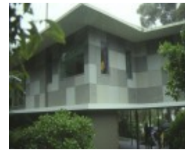
Delbridge House Eaglemont Rear View 1995