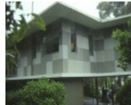
Delbridge House Eaglemont Rear View 1995