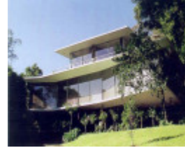
1 delbridge house frontview 1999