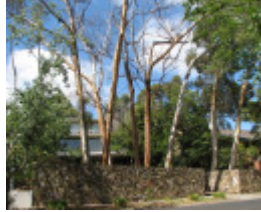
THE DELBRIDGE HOUSE SOHE 2008