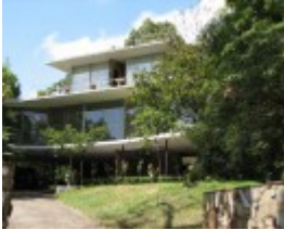
THE DELBRIDGE HOUSE SOHE 2008