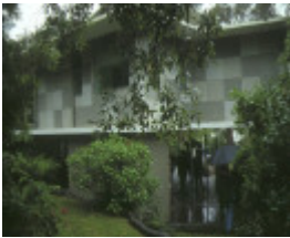
Delbridge House Eaglemont Rear View 1995