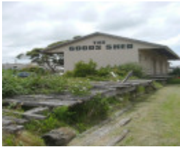
Wonthaggi Railway Station 2006