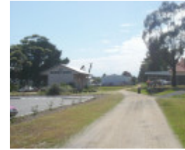
Wonthaggi Railway Station 2006