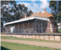
Wonthaggi Railway Station 2006