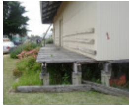
Wonthaggi Railway Station 2006