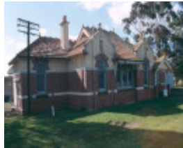
Wonthaggi Railway Station 2006