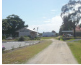
Wonthaggi Railway Station 2006