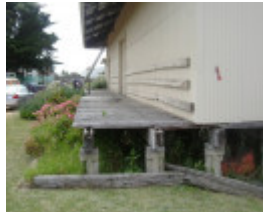
Wonthaggi Railway Station 2006