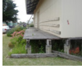
Wonthaggi Railway Station 2006