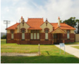
WONTHAGGI RAILWAY STATION SOHE 2008