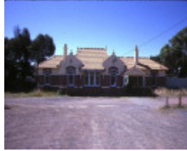
1 wonthaggi railway station front elevation jan1985