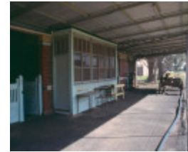
Wonthaggi Railway Station 2006