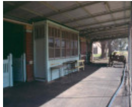
Wonthaggi Railway Station 2006