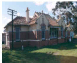
Wonthaggi Railway Station 2006