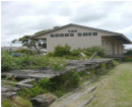
Wonthaggi Railway Station 2006