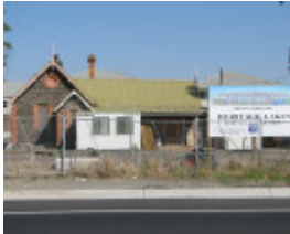
PRIMARY SCHOOL NO. 1975 SOHE 2008