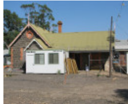
PRIMARY SCHOOL NO. 1975 SOHE 2008