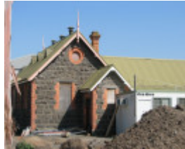
PRIMARY SCHOOL NO. 1975 SOHE 2008