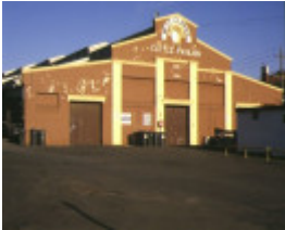
1 royal agricultural showgrounds epsom road ascot vale cattle pavillion