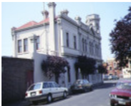
former north fitzroy post office st georges road fitzroy side view