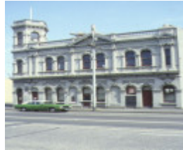
former north fitzroy port office st georges road fitzroy front elevation