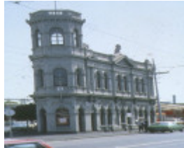
1 former north fitzroy port office st georges road fitzroy front corner elevation