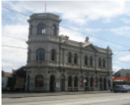
FORMER NORTH FITZROY POST OFFICE SOHE 2008