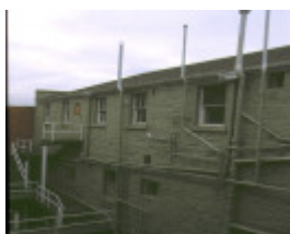
former eastern hill hotel victoria parade fitzroy rear view