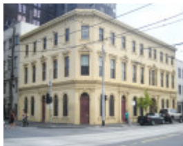
FORMER EASTERN HILL HOTEL SOHE 2008