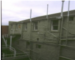
former eastern hill hotel victoria parade fitzroy rear view