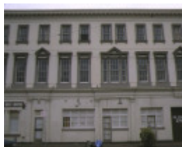
former eastern hill hotel victoria parade fitzroy front view