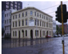
1 former eastern hill hotel victoria parade fitzroy corner view