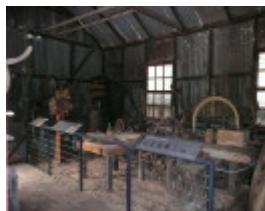
FORMER BLACKSMITH'S COTTAGE AND SHOP SOHE 2008