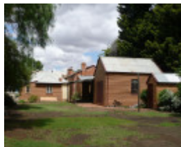
FORMER BLACKSMITH'S COTTAGE AND SHOP SOHE 2008