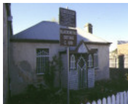
1 former blacksmiths cottage & shop main street bacchus marsh front view of cottage 1997