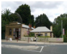
FORMER BLACKSMITH'S COTTAGE AND SHOP SOHE 2008