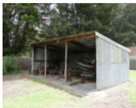
FORMER BLACKSMITH'S COTTAGE AND SHOP SOHE 2008