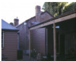
former blacksmiths cottage & shop main street bacchus marsh rear of shop 1997