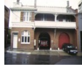
1 hawthorn fire station front view