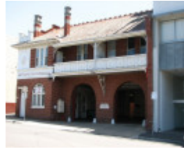
FORMER HAWTHORN FIRE STATION SOHE 2008