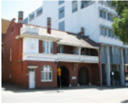
FORMER HAWTHORN FIRE STATION SOHE 2008