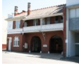
FORMER HAWTHORN FIRE STATION SOHE 2008