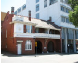
FORMER HAWTHORN FIRE STATION SOHE 2008