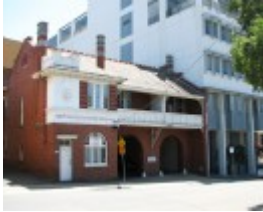
FORMER HAWTHORN FIRE STATION SOHE 2008