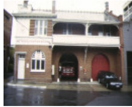
1 hawthorn fire station front view