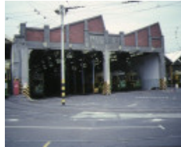
1 essendon tramway depot mount alexander road ascot vale saw tooth roof of tran shed