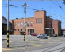
ESSENDON TRAMWAY DEPOT SOHE 2008