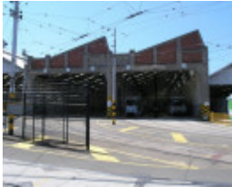
ESSENDON TRAMWAY DEPOT SOHE 2008