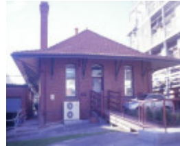
h01794 Jennerian Building Poplar Road Parkville South exterior SHE Project 2003