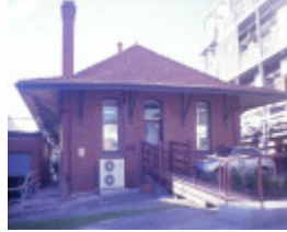
h01794 Jennerian Building Poplar Road Parkville South exterior SHE Project 2003