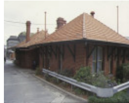
1 Jennerian Building CSL Ltd Poplar Road Parkville ext1