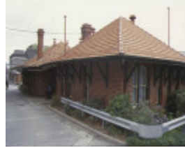
1 Jennerian Building CSL Ltd Poplar Road Parkville ext1