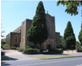
ST MONICAS CATHOLIC CHURCH SOHE 2008