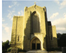
1 st monicas catholic church mount alexander road moonee ponds front elevation may1996