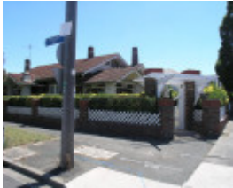
THE PEBBLES SOHE 2008