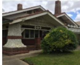
THE PEBBLES October 2016