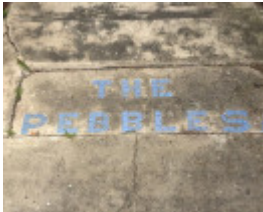
THE PEBBLES October 2016