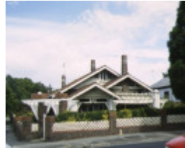
1 the pebbles droop street footsray front view 1997