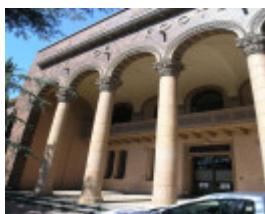
MARIBYRNONG TOWN HALL SOHE 2008