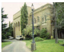
1 footscray town hall hall napier street footscray front view 1996