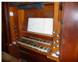
MARIBYRNONG TOWN HALL SOHE 2008