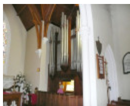
MARIBYRNONG TOWN HALL SOHE 2008