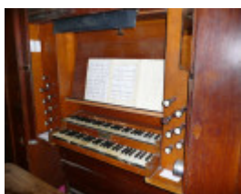
MARIBYRNONG TOWN HALL SOHE 2008