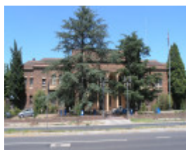
MARIBYRNONG TOWN HALL SOHE 2008