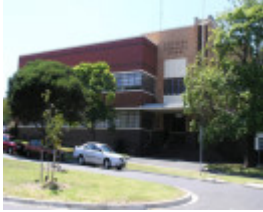
FORMER ESSENDON TECHNICAL SCHOOL SOHE 2008