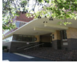
FORMER ESSENDON TECHNICAL SCHOOL SOHE 2008