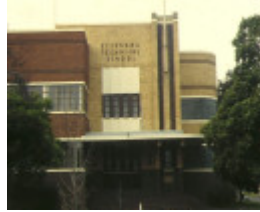
1 former essendon technical school buckley street essendon front entrance