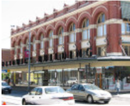
HOOPERS STORE SOHE 2008