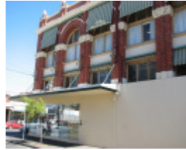
HOOPERS STORE SOHE 2008