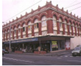
1 hoopers store sydney road brunswick front view