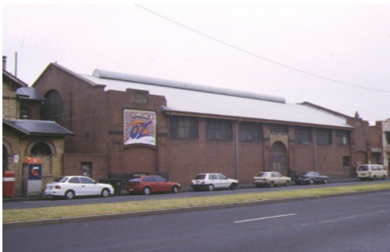
1 naval drill hall side view oct1997