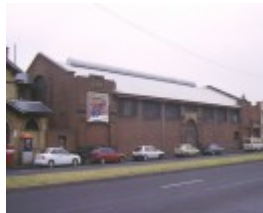
1 naval drill hall side view oct1997