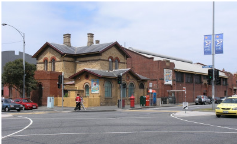
NAVAL DRILL HALL AND FORMER POST OFFICE SOHE 2008