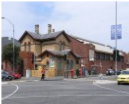
NAVAL DRILL HALL AND FORMER POST OFFICE SOHE 2008