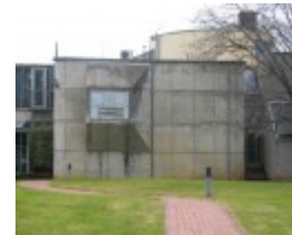
H2192 Fmr Clyde Cameron College Wodonga Aug 08 37