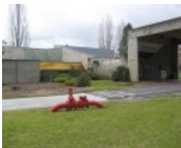
H2192 fmr Clyde Cameron College Wodonga Aug 08 36