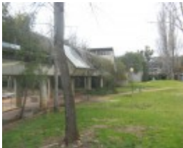
4938 Fmr Clyde Cameron College Wodonga Aug 08