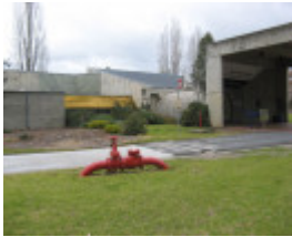
H2192 fmr Clyde Cameron College Wodonga Aug 08 36