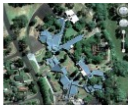
Clyde Cameron College.jpg