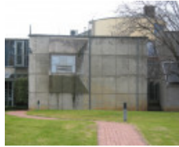
H2192 Fmr Clyde Cameron College Wodonga Aug 08 37