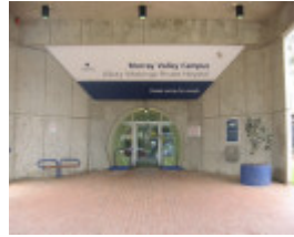
H2192 Fmr Clyde Cameron College Wodonga Aug 08