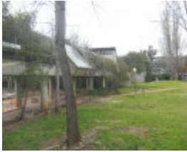
4938 Fmr Clyde Cameron College Wodonga Aug 08