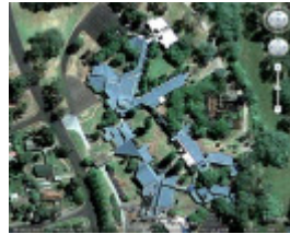
Clyde Cameron College.jpg