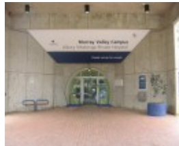
H2192 Fmr Clyde Cameron College Wodonga Aug 08