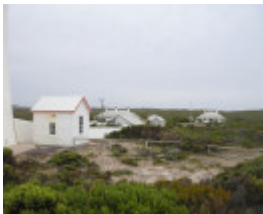
CAPE NELSON LIGHTSTATION SOHE 2008