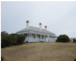
CAPE NELSON LIGHTSTATION SOHE 2008