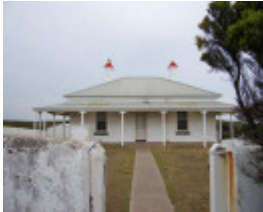
CAPE NELSON LIGHTSTATION SOHE 2008