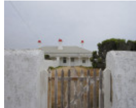
CAPE NELSON LIGHTSTATION SOHE 2008