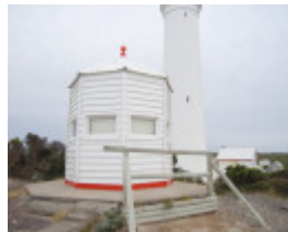
CAPE NELSON LIGHTSTATION SOHE 2008