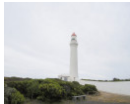
CAPE NELSON LIGHTSTATION SOHE 2008