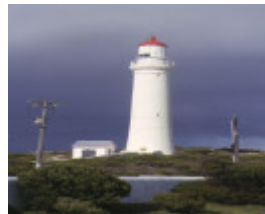
1 cape nelson lightstation portland lighthouse sep1998