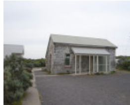
CAPE NELSON LIGHTSTATION SOHE 2008