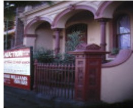
terrace 203 victoria parade fitzroy entrance gate jul1984