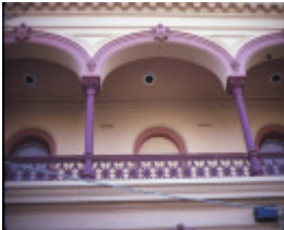
terrace 203 victoria parade fitzroy detail of balcony jul1984