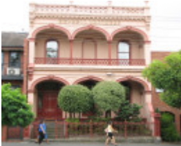
TERRACE SOHE 2008