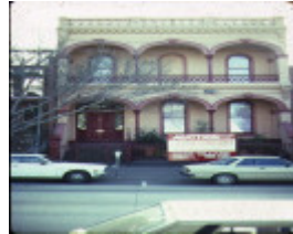
1 terrace 203 victoria parade fitzroy front view jul1984