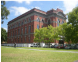
FORMER NORTH FITZROY ELECTRIC RAILWAY SUBSTATION SOHE 2008