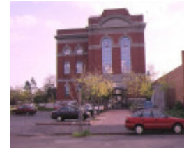
former north fitzroy electric railway substation brunswick street north fitzroy front view jun1995