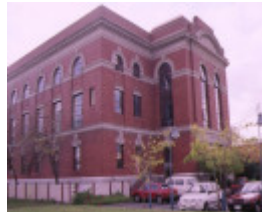
1 former north fitzroy electric railway substation brunswick street north fitzroy side elevation jun1995