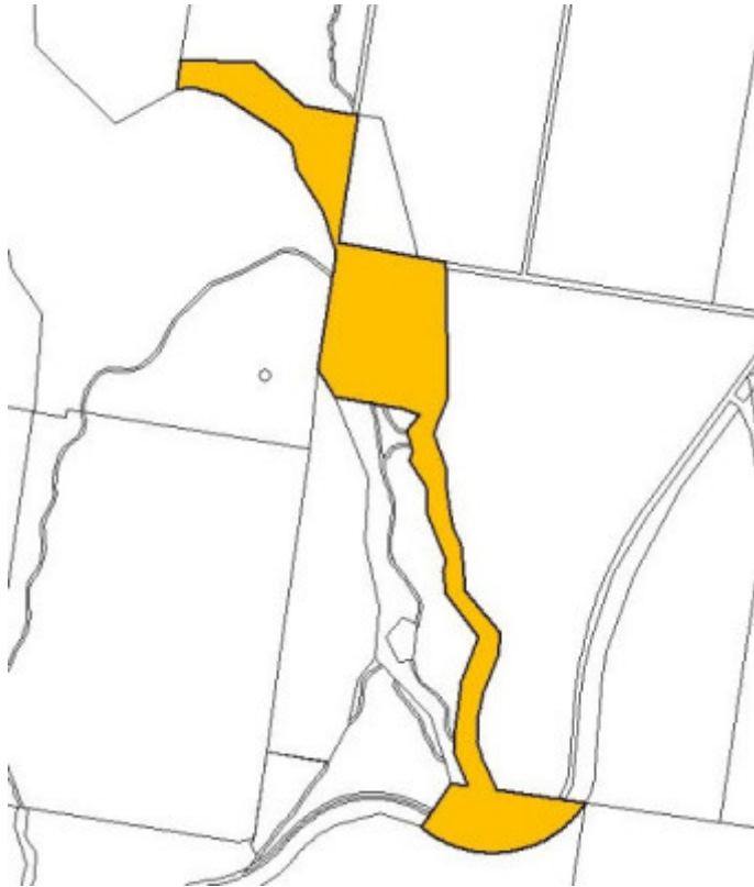
magpie creek historic reserve.jpg