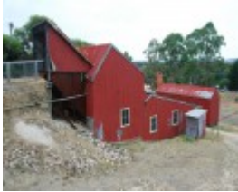
MALDON STATE BATTERY SOHE 2008