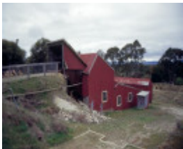
h01264 maldon state battery adair street maldon battery building she project 2003