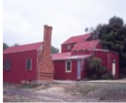
h01264 1 maldon state battery adair street street maldon chimney assay room she project 2003