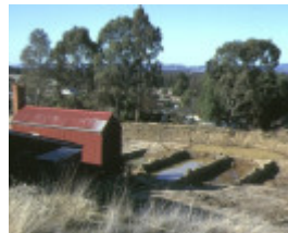
h01264 maldon state battery adair street maldon pits jul1994