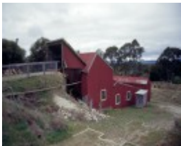
h01264 maldon state battery adair street maldon battery building she project 2003