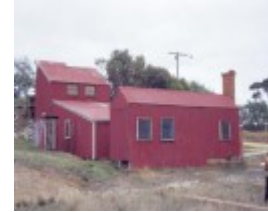
h01264 maldon state battery adair street maldon assay room battery she project 2003