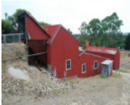
MALDON STATE BATTERY SOHE 2008