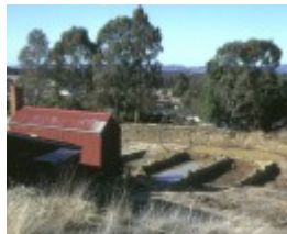
h01264 maldon state battery adair street maldon pits jul1994