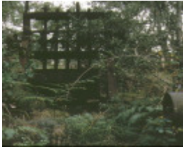
1 gambetta reef battery omeo old iron work