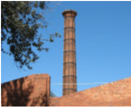
former australian licorice factory chimney