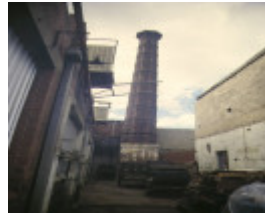
1 former australian licorice factory chimney & fire tunnel remains victoria street brunswick chimney view