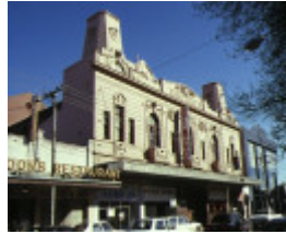
1 former barkley theatre barkly street footscray front view