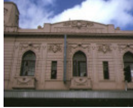
former barkley theatre barkly street footscray front windows aug1990