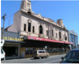
FORMER BARKLY THEATRE SOHE 2008