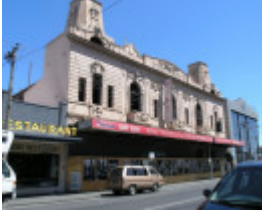
FORMER BARKLY THEATRE SOHE 2008