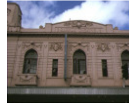
former barkley theatre barkly street footscray front windows aug1990