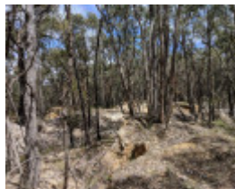
Pebble Dump (December 2019)