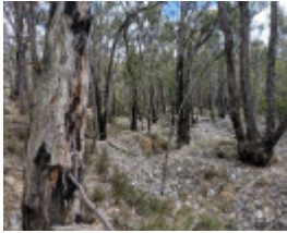
Pebble Dumps (December 2019)