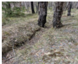
Water Race from Russels Reservoir (December 2019)