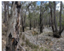
Pebble Dumps (December 2019)