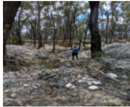
Pebble Dump (December 2019)