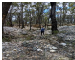
Pebble Dump (December 2019)