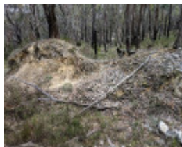
Pebble Dump (December 2019)