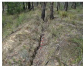
Water Race from Russels Reservoir (December 2019)