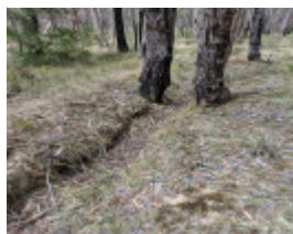
Water Race from Russels Reservoir (December 2019)