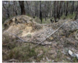
Pebble Dump (December 2019)