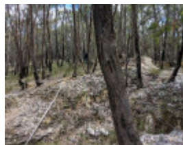
Pebble Dump (December 2019)