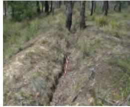
Water Race from Russels Reservoir (December 2019)