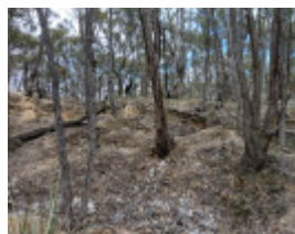
Sluice Pit (December 2019)