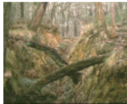
1 humbug hill sluicing creswick landscape