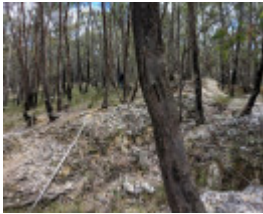
Pebble Dump (December 2019)