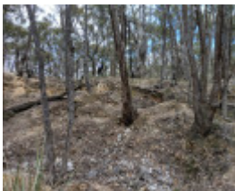
Sluice Pit (December 2019)