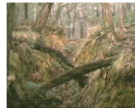
1 humbug hill sluicing creswick landscape