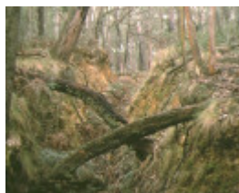
1 humbug hill sluicing creswick landscape