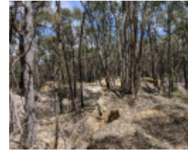
Pebble Dump (December 2019)