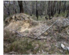
Pebble Dump (December 2019)