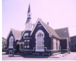
1 footscray primary school no 253 geelong road footscray front view mar1998