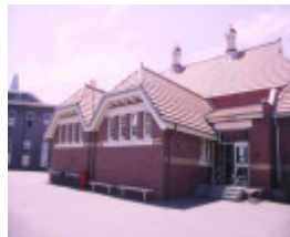
footscray primary school no 253 geelong road footscray infant school feb1998