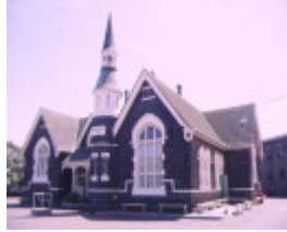
1 footscray primary school no 253 geelong road footscray front view mar1998