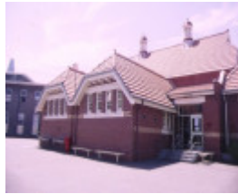
footscray primary school no 253 geelong road footscray infant school feb1998