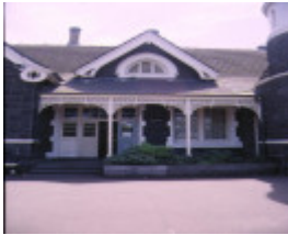
footscray primary school no 253 geelong road footscray entrance feb1998