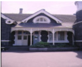
footscray primary school no 253 geelong road footscray entrance feb1998