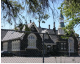
PRIMARY SCHOOL NO.253 SOHE 2008