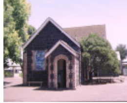
footscray primary school no 253 geelong road footscray bluestone entrance feb1998