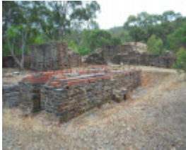
NORTH BRITISH GOLD MINE SOHE 2008