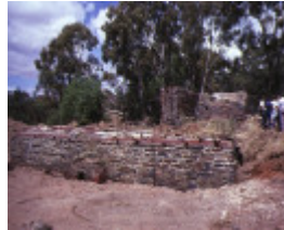
1 north british gold mine parkins reef road maldon side view dec1984