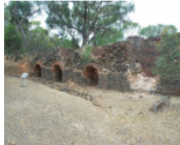
NORTH BRITISH GOLD MINE SOHE 2008