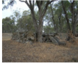
NINE MILE COMPANY GOLD MINE SOHE 2008