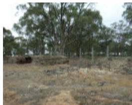
NINE MILE COMPANY GOLD MINE SOHE 2008