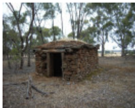
NINE MILE COMPANY GOLD MINE SOHE 2008