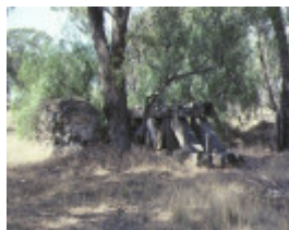
1 nine mile company gold mine wedderburn site view