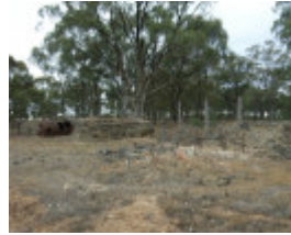
NINE MILE COMPANY GOLD MINE SOHE 2008