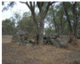
NINE MILE COMPANY GOLD MINE SOHE 2008