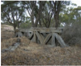
NINE MILE COMPANY GOLD MINE SOHE 2008