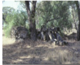
1 nine mile company gold mine wedderburn site view