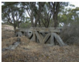
NINE MILE COMPANY GOLD MINE SOHE 2008