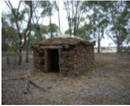
NINE MILE COMPANY GOLD MINE SOHE 2008