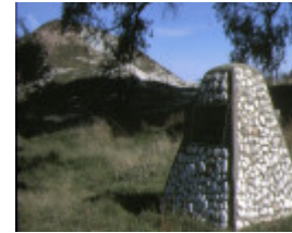
1 new australasian no 2 deep lead gold mine moores road creswick memorial