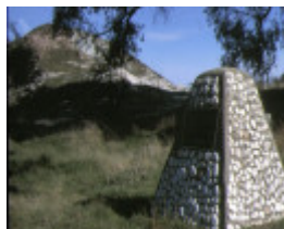
1 new australasian no 2 deep lead gold mine moores road creswick memorial