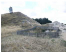
NEW AUSTRALASIAN NO. 2 DEEP LEAD GOLD MINING MEMORIAL AND SITE SOHE 2008