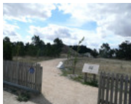
NEW AUSTRALASIAN NO. 2 DEEP LEAD GOLD MINING MEMORIAL AND SITE SOHE 2008