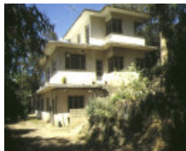
1 former naughton house & factory hutchinson avenue warrandyte side elevation