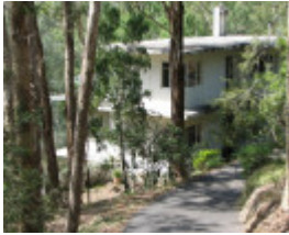
FORMER NAUGHTON HOUSE AND FACTORY SOHE 2008