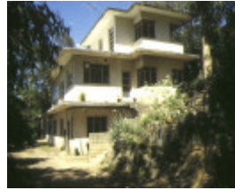
1 former naughton house & factory hutchinson avenue warrandyte side elevation