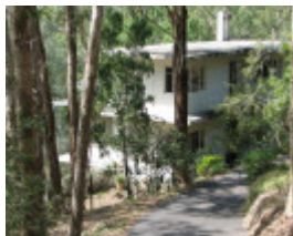
FORMER NAUGHTON HOUSE AND FACTORY SOHE 2008