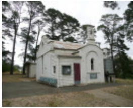
FORMER FRANKLINFORD COMMON SCHOOL SOHE 2008