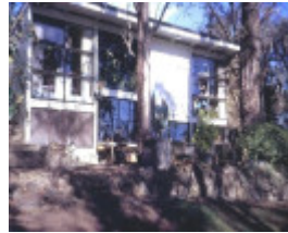
h01313 inge and grahame king house drysdale road warrandyte studios facing north she project 2003