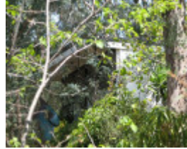
INGE AND GRAHAME KING HOUSE SOHE 2008