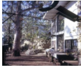
h01313 inge and grahame king house drysdale road warrandyte studios side north she project 2003