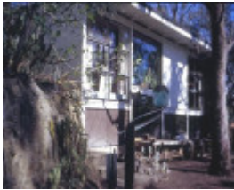
h01313 inge and grahame king house drysdale road warrandyte side view she project 2003