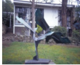
h01313 1 inge and grahame king house drysdale road warrandyte sculpture in garden she project 2003