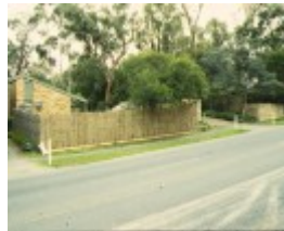
1 winter park cluster housing high street doncaster street view nov1996