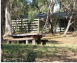
WINTER PARK CLUSTER HOUSING SOHE 2008