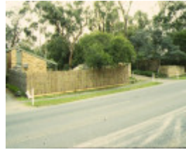
1 winter park cluster housing high street doncaster street view nov1996