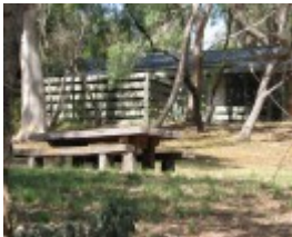
WINTER PARK CLUSTER HOUSING SOHE 2008