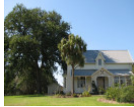
BALLAM PARK SOHE 2008