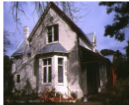
1 ballam park frankston front view