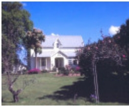
ballam park cranbourne road frankston front she project 2003