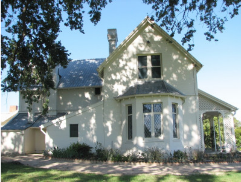
BALLAM PARK SOHE 2008