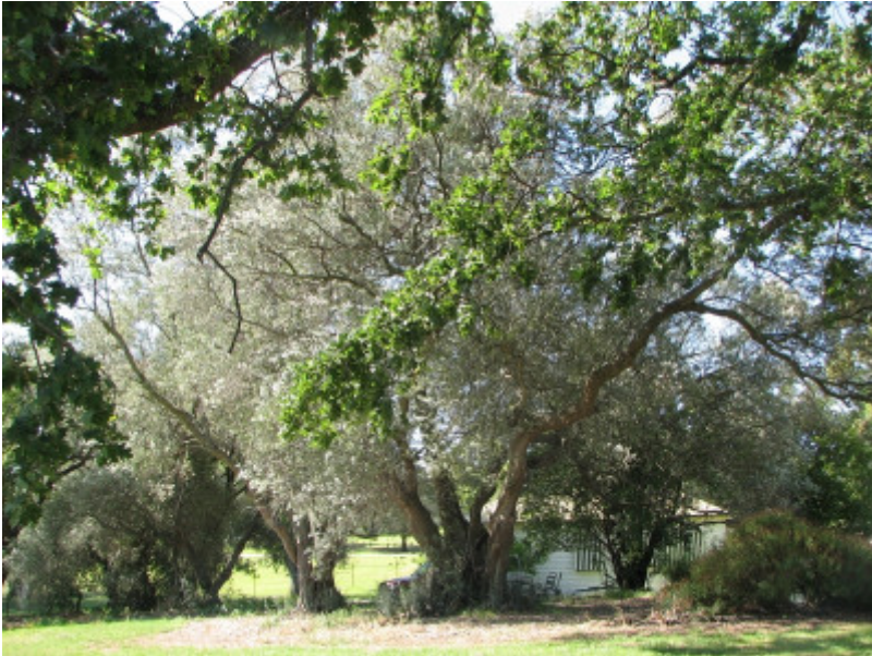
BALLAM PARK SOHE 2008