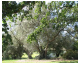
BALLAM PARK SOHE 2008