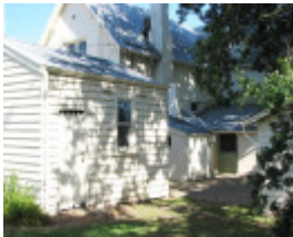
BALLAM PARK SOHE 2008