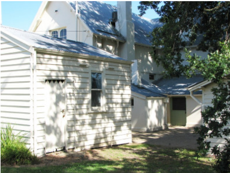
BALLAM PARK SOHE 2008