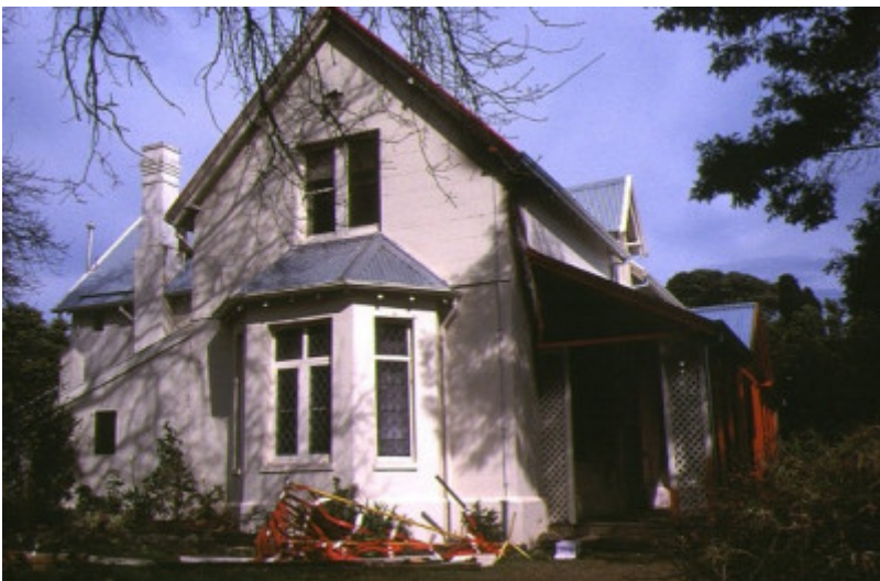
1 ballam park frankston front view