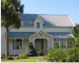
BALLAM PARK SOHE 2008