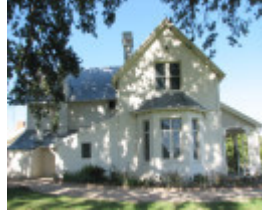
BALLAM PARK SOHE 2008