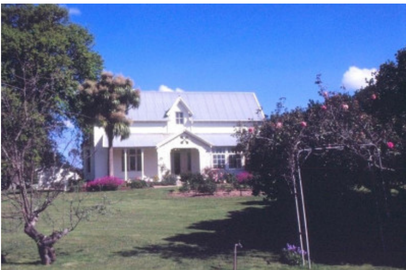
ballam park cranbourne road frankston front she project 2003