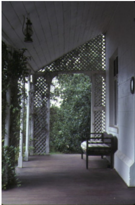
ballam park frankston front porch mar1984