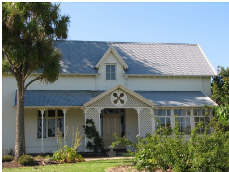
BALLAM PARK SOHE 2008