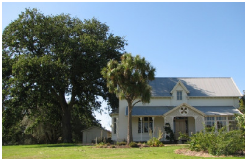
BALLAM PARK SOHE 2008