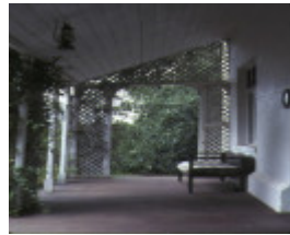
ballam park frankston front porch mar1984