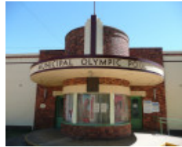
MARYBOROUGH MUNICIPAL OLYMPIC SWIMMING COMPLEX SOHE 2008