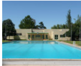
MARYBOROUGH MUNICIPAL OLYMPIC SWIMMING COMPLEX SOHE 2008