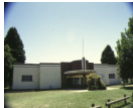
1 maryborough olympic complex building entrance