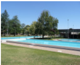
MARYBOROUGH MUNICIPAL OLYMPIC SWIMMING COMPLEX SOHE 2008