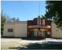
MARYBOROUGH MUNICIPAL OLYMPIC SWIMMING COMPLEX SOHE 2008