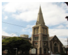
FORMER PRESBYTERIAN CHURCH BUILDINGS SOHO 2008