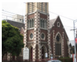
FORMER PRESBYTERIAN CHURCH BUILDINGS SOHO 2008