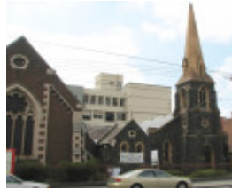
FORMER PRESBYTERIAN CHURCH BUILDINGS SOHE 2008