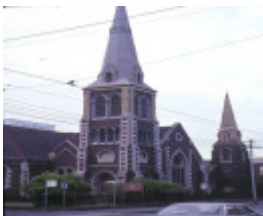
1 former presbyterian church buildings sydney road brunswick front view