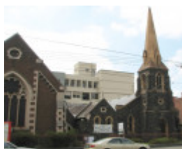
FORMER PRESBYTERIAN CHURCH BUILDINGS SOHO 2008