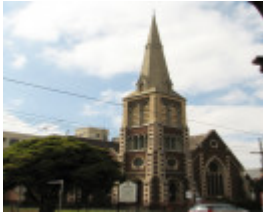
FORMER PRESBYTERIAN CHURCH BUILDINGS SOHE 2008