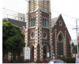
FORMER PRESBYTERIAN CHURCH BUILDINGS SOHE 2008