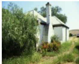
former leaky's residence millers road bacchus marsh side view