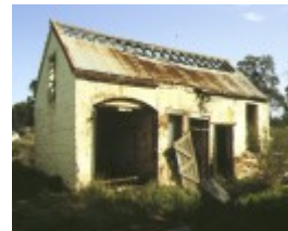
former leaky's residence millers road bacchus marsh stables aug1992