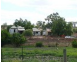
FORMER LEAHY'S RESIDENCE SOHE 2008