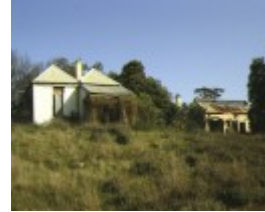
1 former leaky's residence millers road bacchus marsh front view of property aug1992