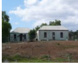
FORMER LEAHY'S RESIDENCE SOHE 2008