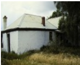
former leaky's residence millers road bacchus marsh rear view