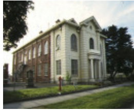
1 former essendon high school buckley street essendon front entrance oct1996