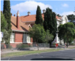
FORMER ESSENDON HIGH SCHOOL SOHE 2008