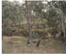
1 new nuggetty gully alluvial gold workings yandoit creek werona road yandoti earth works