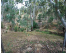
NEW NUGGETTY GULLY ALLUVIAL GOLD WORKINGS SOHE 2008