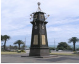
SOUTH AFRICAN WAR MEMORIAL SOHE 2008