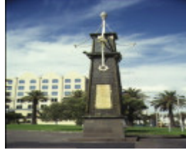
1 south african soldiers memorial alfred square st kilda front view 1996