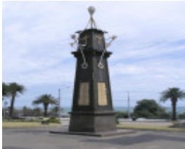
SOUTH AFRICAN WAR MEMORIAL SOHE 2008