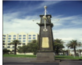
1 south african soldiers memorial alfred square st kilda front view 1996