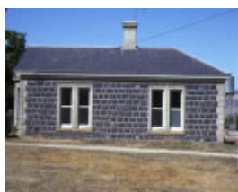
frogmore homestead hamilton highway fyansford side view