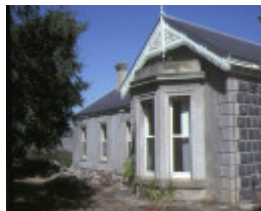
frogmore homestead hamilton highway fyansford bay window