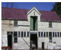
1 frogmore hamilton highway fyansford stables front view