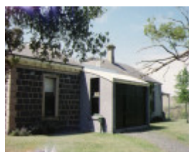
frogmore homestead hamilton highway fyansford rear elevation oct1994