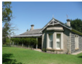
FROGMORE SOHE 2008