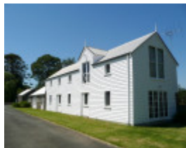
FROGMORE SOHE 2008