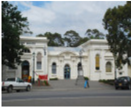
FORMER HEATHCOTE COURT HOUSE AND SHIRE COUNCIL CHAMBERS SOHE 2008