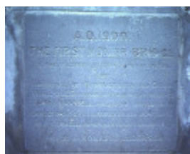
bridge over moorabool river fyansford dedication stone jul1984