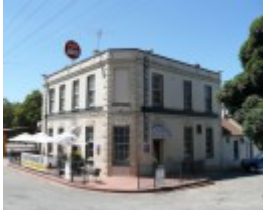
FYANSFORD HOTEL SOHE 2008