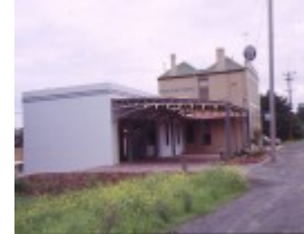
fyansford hotel fyansford rear view