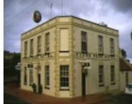
1 fyansford hotel fyansford front corner view apr 1997