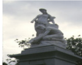
1 gold monument bendigo side view mar1997