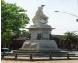
DISCOVERY OF GOLD MONUMENT SOHE 2008