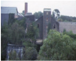
1 barwon paper mill complex fyansford view of property