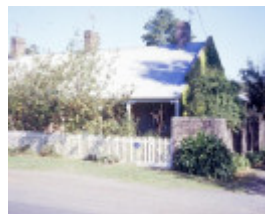
barwon paper mill complex lower paper mills road fyansford no 42 workers cottage front view she project 2003