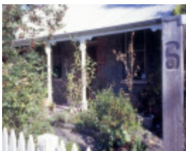
barwon paper mill complex lower paper mills road fyansford no 42 workers cottage close up she project 2003