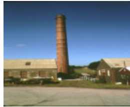
barwon paper mill complex fyansford chimney