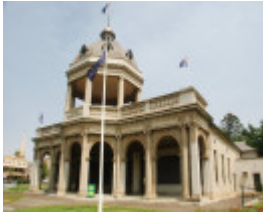
RETURNED SOLDIERS MEMORIAL HALL SOHE 2008