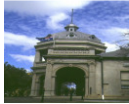
1 returned soldiers hall bendigo front dome