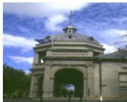
1 returned soldiers hall bendigo front dome