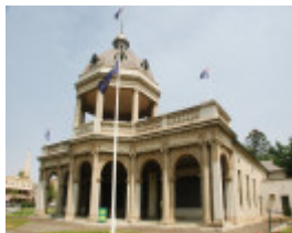
RETURNED SOLDIERS MEMORIAL HALL SOHE 2008