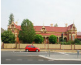
PARK TERRACE SOHE 2008