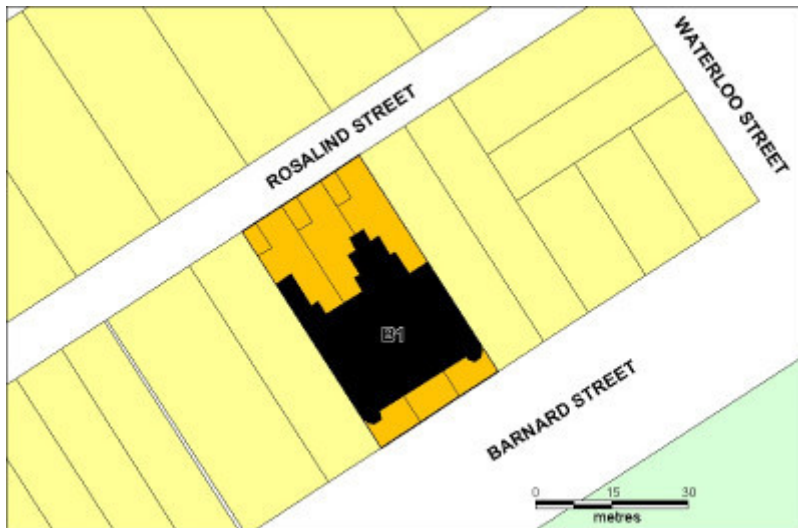
park terrace bendigo plan