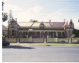
1 park terrace bernard street bendigo front elevation nov1997